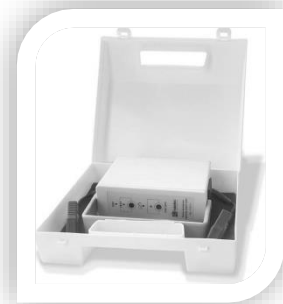
Lightning Counter Tester Ref P8015